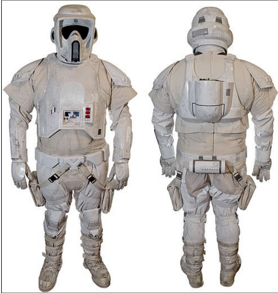
Model TS 7880