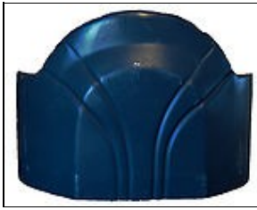
Ab Armor For 501st approval: