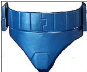
Codpiece and belt front For 501st approval: