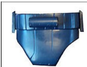
Posterior Armor, belt rear and detonator For 501st approval: