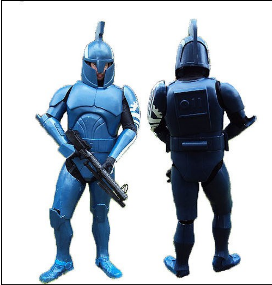
Model TR-4126