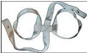
Ejection Harness For 501st approval: