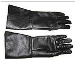
Black Gauntlet Gloves For 501st approval: