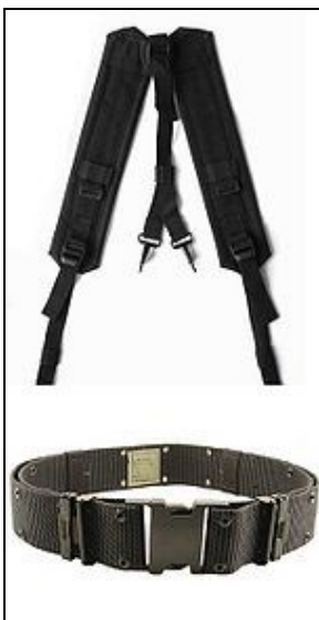
Web harness and optional web belt