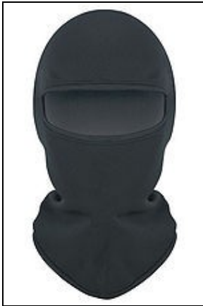
Balaclava For 501st approval: