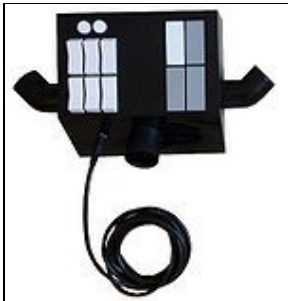
Type B Chestbox For 501st approval: