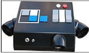
Type A Chestbox For 501st approval: