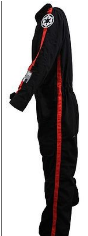
Black Imperial Flight Suit For 501st approval: