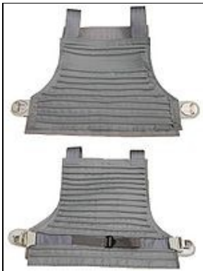
Grey Flak Vest