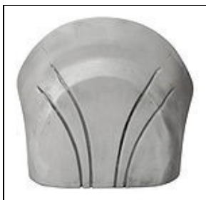
Abdomen Armor For 501st approval: