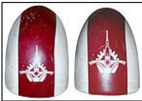
Shoulder Armor For 501st approval: