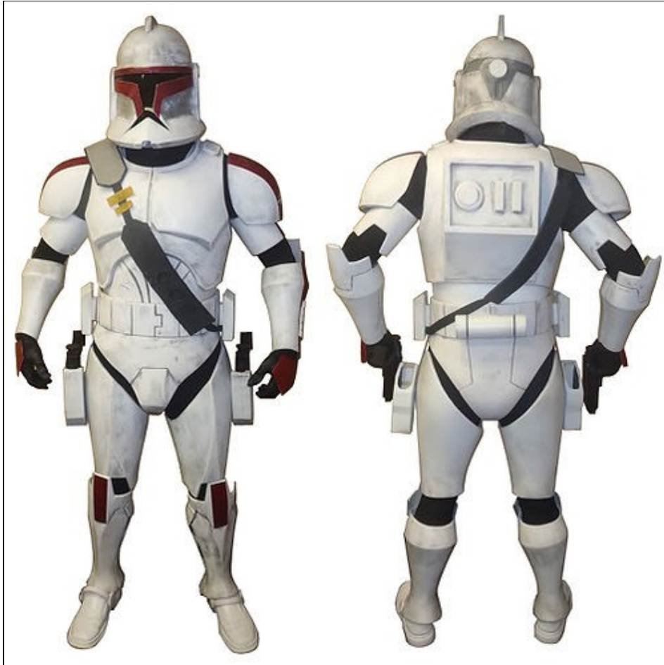
Model TC 5144