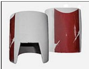
Upper Arm Armor For 501st approval: