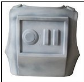
Back Armor For 501st approval: