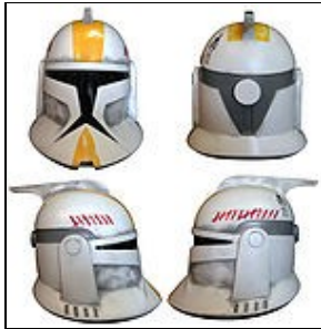
Helmet For 501st approval:

The following costume components are present and appear as described below.