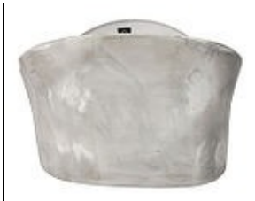
Kidney Armor For 501st approval: