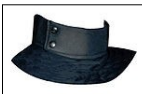
Neck Seal For 501st approval: