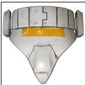
Codpiece For 501st approval: