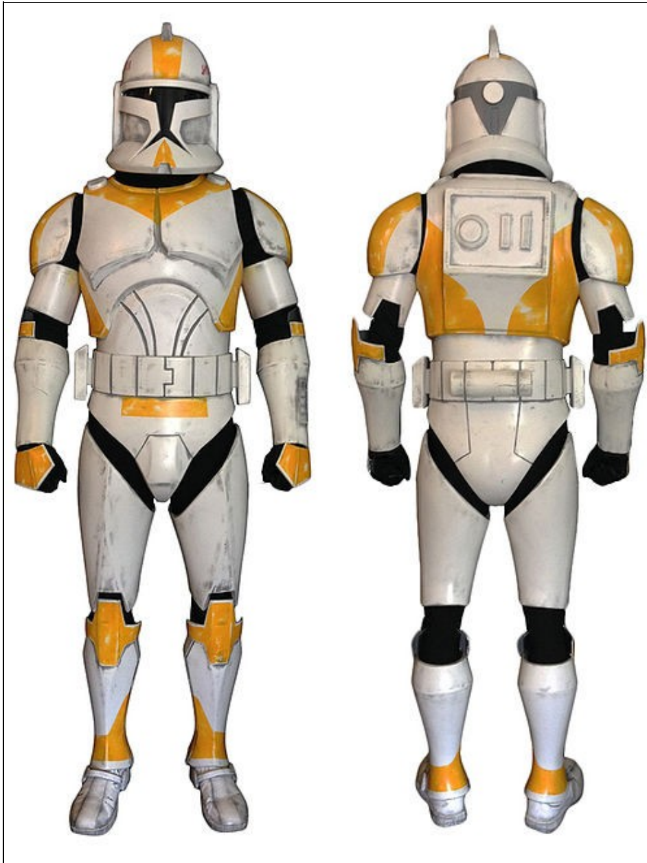
Model TC 450, Photo by Garet Jones