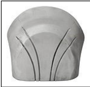
Abdomen Armor For 501st approval: