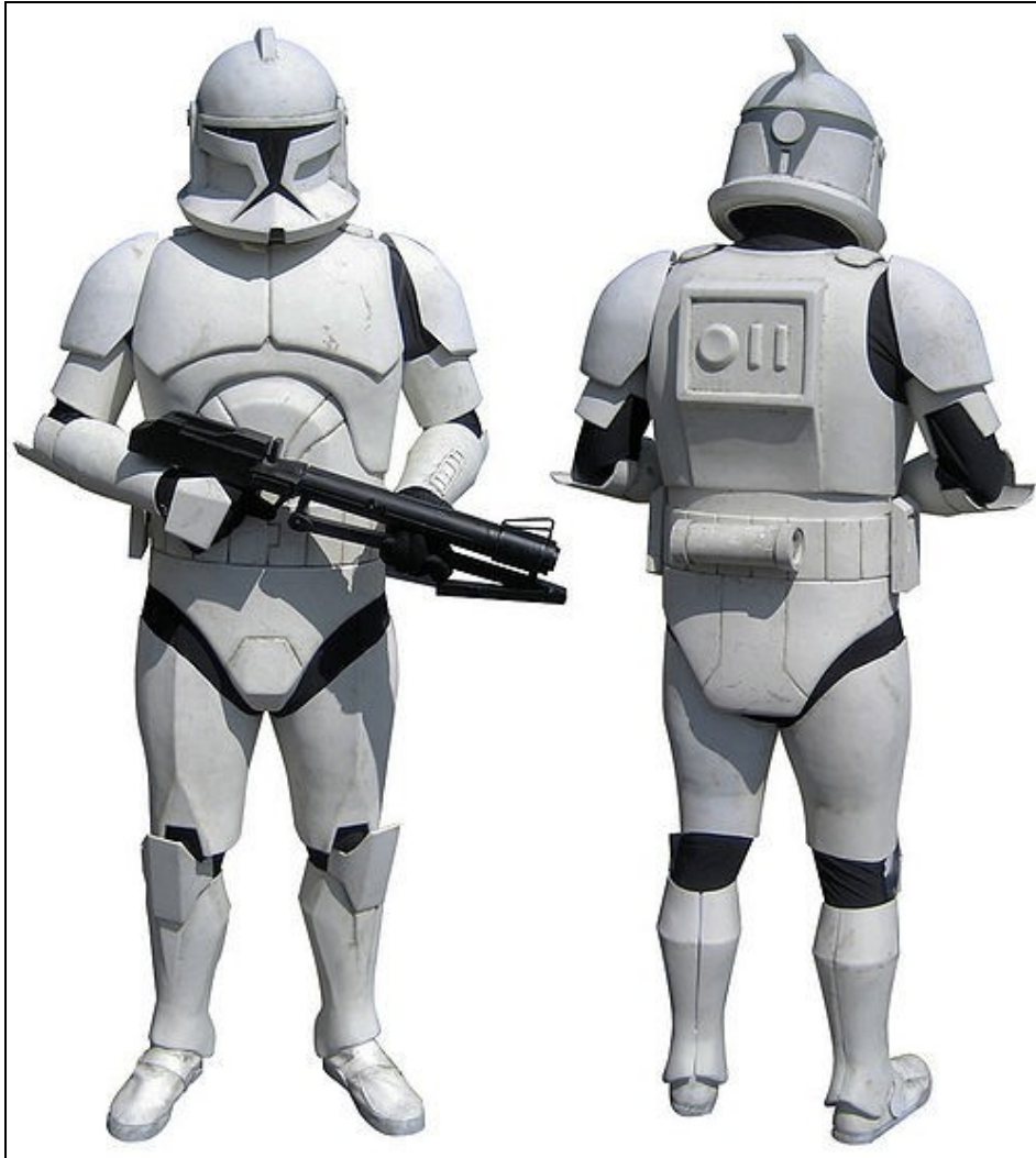
Model TC 7602