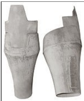
Forearm Armor For 501st approval: