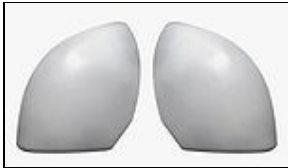
Shoulder Armor For 501st approval: