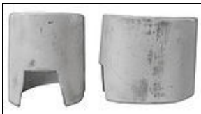
Upper Arm Armor For 501st approval: