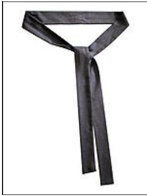
Sash For 501st approval: