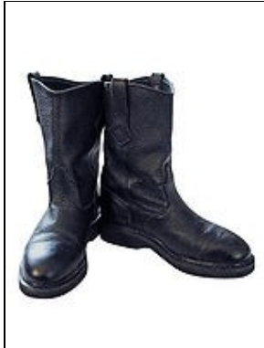
Foot wear For 501st approval:

For level two certification (if applicable):