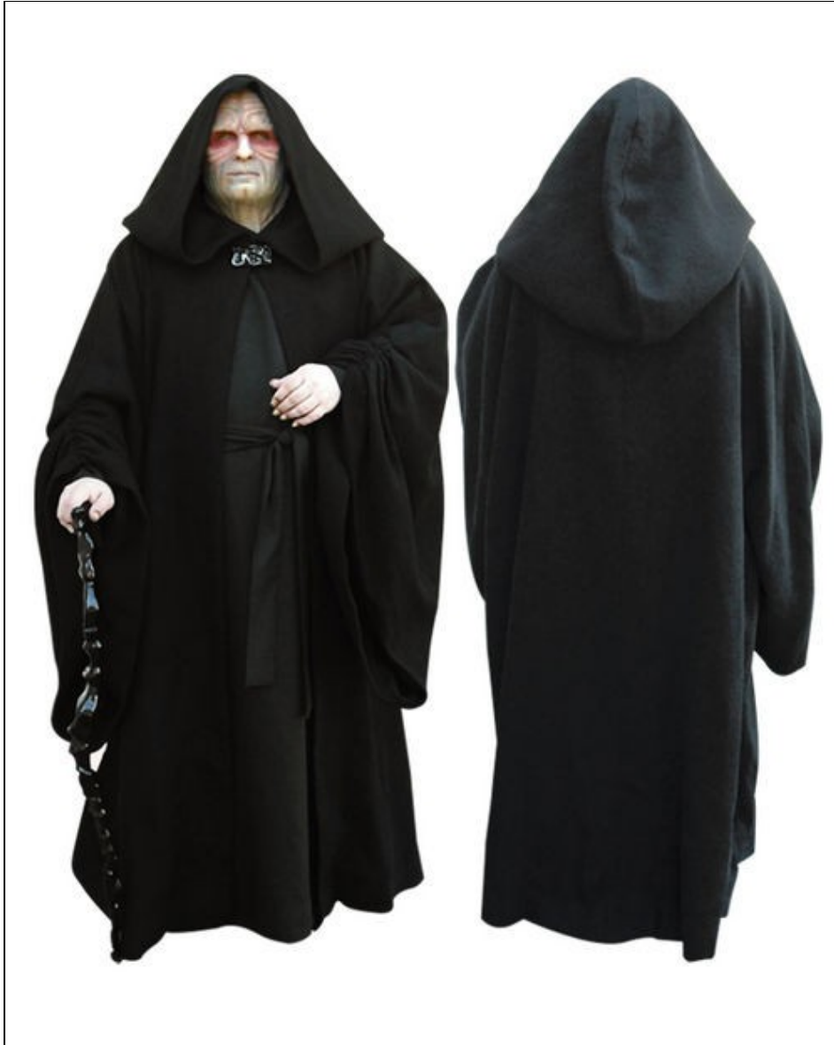
Model SL-3940