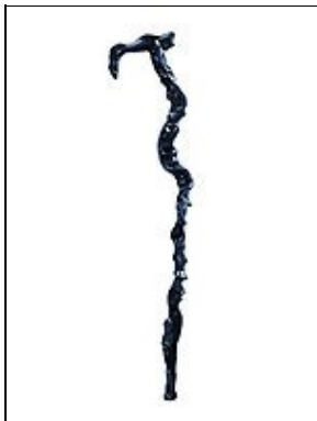
Cane For 501st approval: