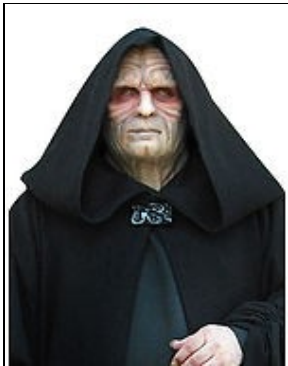
Palpatine's Face For 501st approval:

The following costume components are present and appear as described below.