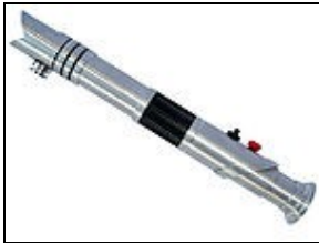
Lightsaber For 501st approval:

Items below are optional costume accessories. These items are not required for approval, but if present appear as described below.