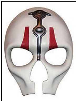
Mask For 501st approval: