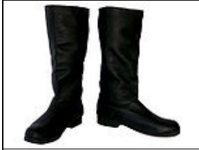
Boots For 501st approval: