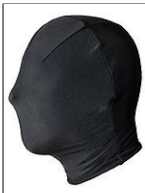
Face Covering For 501st approval: