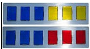
Grand Admiral Rank Bar For 501st approval: