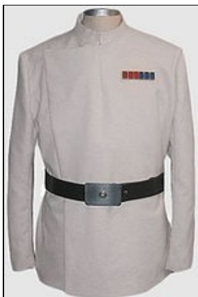
Officer Tunic, Cream For 501st approval: