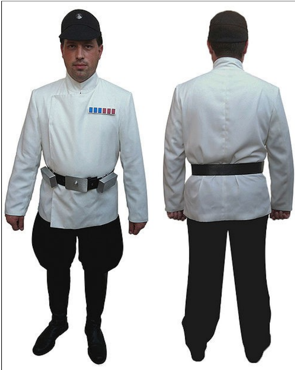
Model ID 6276