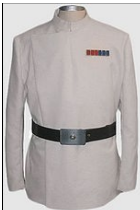
Officer Tunic, Cream For 501st approval: