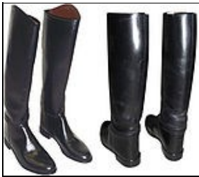
Officer Boots For 501st approval: