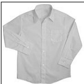
Dress Shirt For 501st approval:

Items below are optional costume accessories. These items are not required for approval, but if present appear as described below.