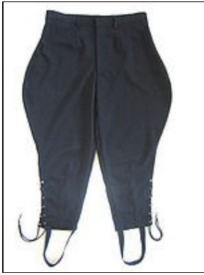
Jodhpur Trousers, black For 501st approval: