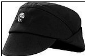
Imperial Hat, black For 501st approval:

The following costume components are present and appear as described below.