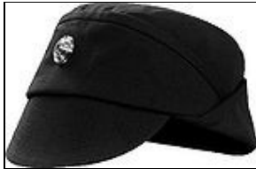
Imperial Hat, black For 501st approval:

The following costume components are present and appear as described below.