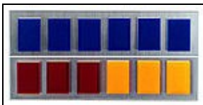
Tarkin's Rank Bar