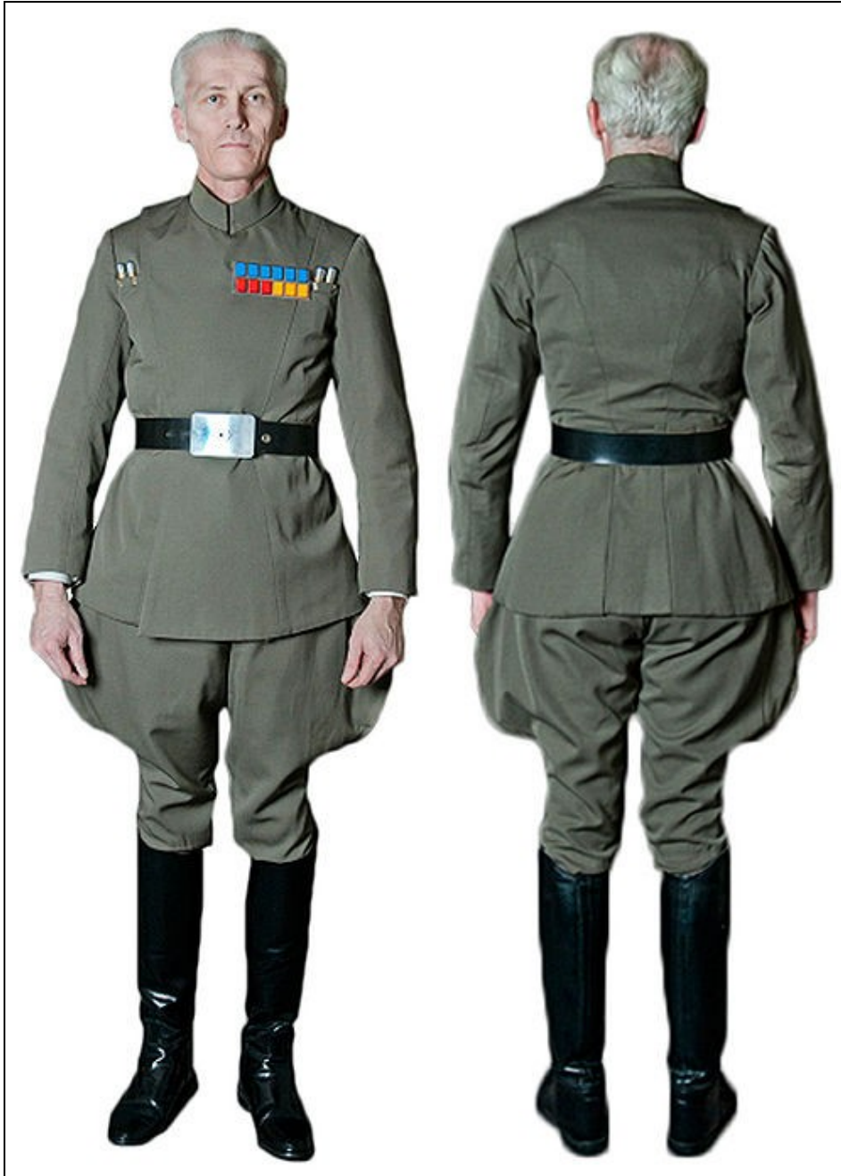
Model ID 784