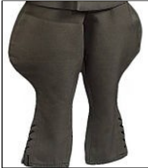
Jodphur Trousers, Olive