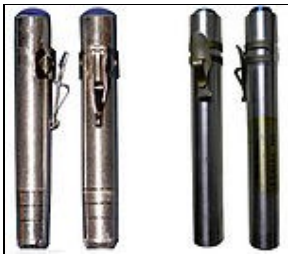
Code Cylinders For 501st approval: