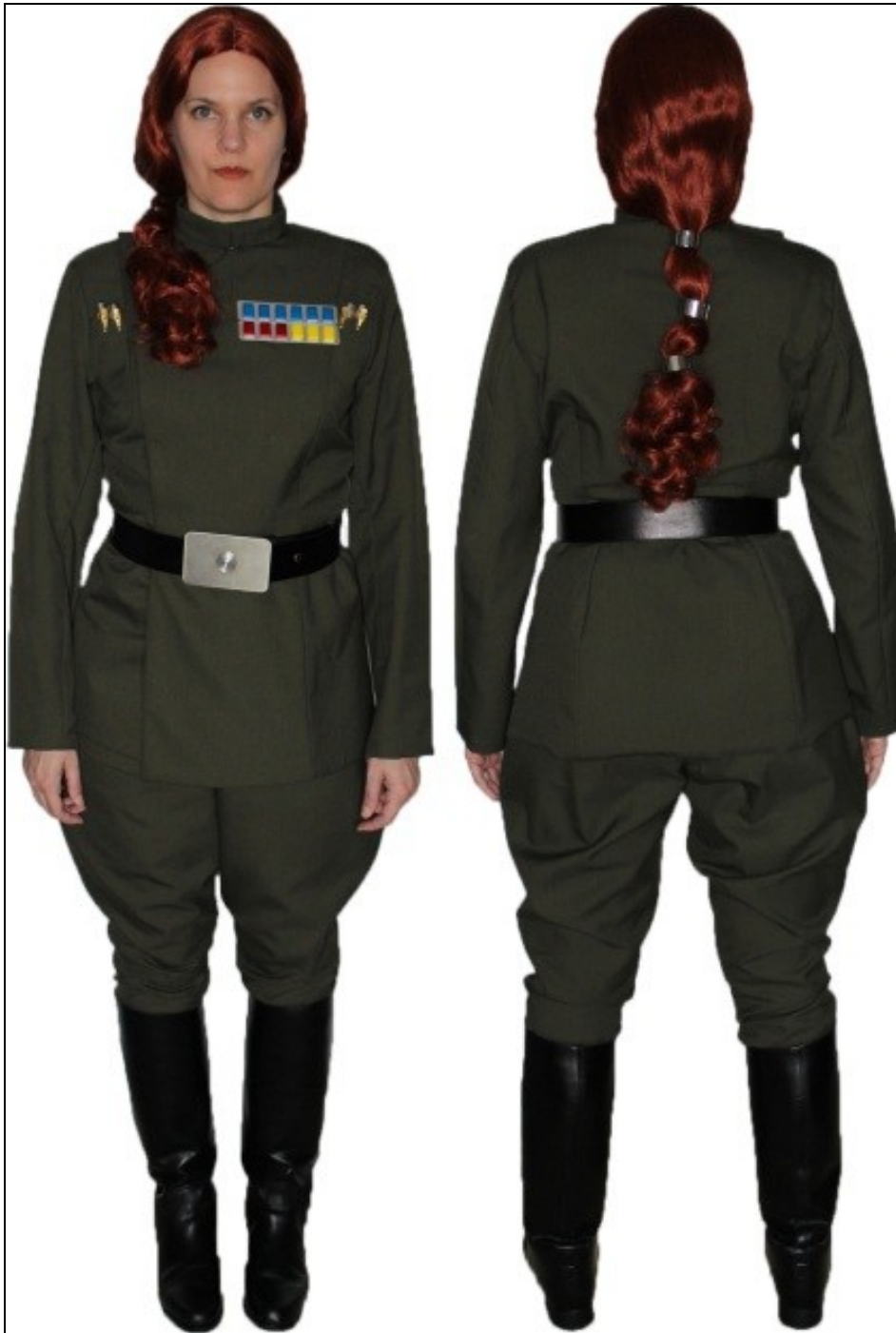
Model ID 8693