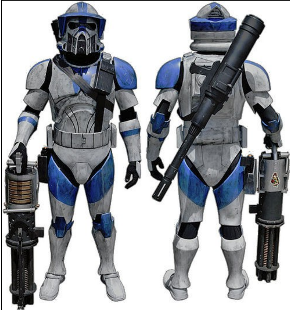
Model CX 5298