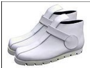
Boots For 501st approval: