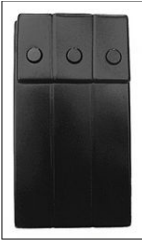
Holster For 501st approval: