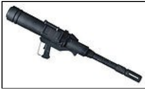
RPS-6 Rocket Launcher For 501st approval:

Manufactured by Merr-Sonn Munitions, Inc, the Z-6 Cannon incorporates a rotary assembly of six barrels, wrapped around a coolant-lined core, providing a tremendous sustained rate of fire. Because it is large and can become unwieldy, the Z-6 is reserved for special-issue deployment and requires training to use effectively.