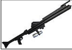
DC-15A Blaster Rifle (animated style) For 501st approval:

Manufactured by BlasTech Industries, this blaster is the standard issue weapon carried by the Clone Troopers of the Grand Army of the Republic.