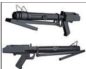
DC-15S Blaster Carbine (animated style) For 501st approval:

Manufactured by BlasTech Industries, this weapon is commonly carried by the Troopers of the Galactic Republic.