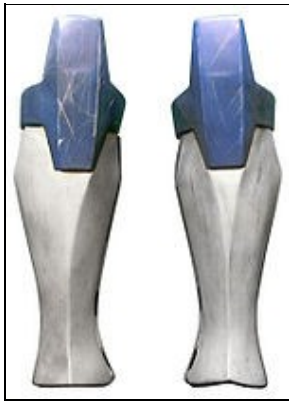
Lower Leg Armor For 501st approval: