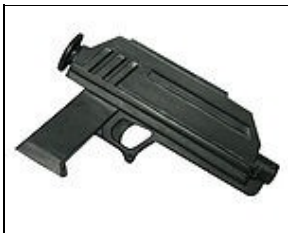
DC-17 Hand Blaster (animated style) For 501st approval:

Manufactured by BlasTech Industries, DC-17 pistols are designed for use as secondary weapons. Because they are widely recognized for their high stopping power and firing rate, many battlefield officers use them as primarily combat weapons.