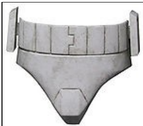
Codpiece and Belt front For 501st approval: