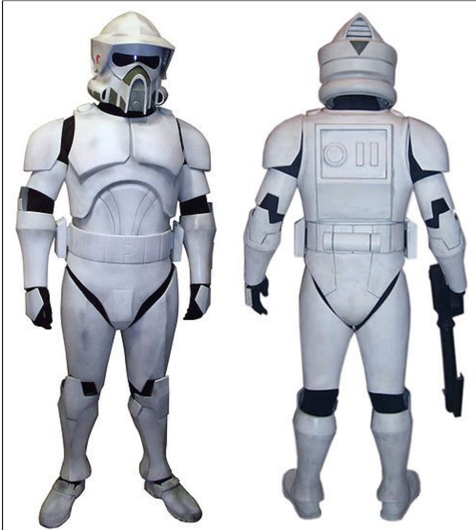
Model CX 4365