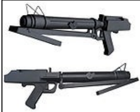
DC-15S Blaster Carbine (animated style) For 501st approval:

Items below are optional costume accessories. These items are not required for approval, but if present appear as described below.