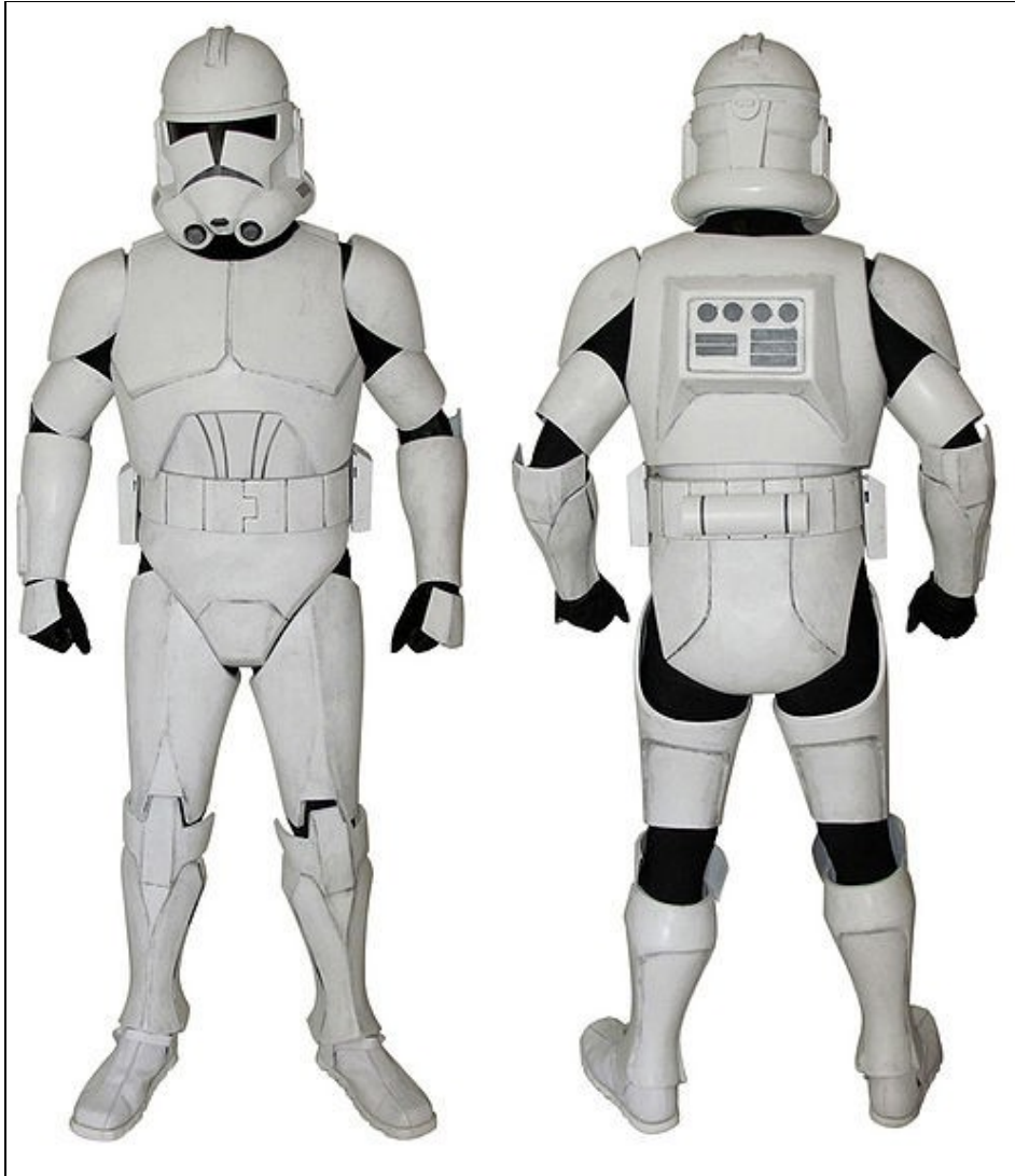
Model CT 23456