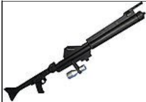
DC-15A Blaster Rifle (animated style) For 501st approval:

Manufactured by BlasTech Industries, this blaster is the standard issue weapon carried by the Clone Troopers of the Grand Army of the Republic.