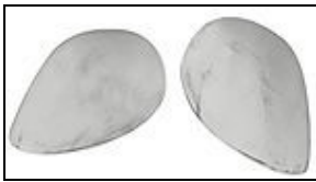
Shoulder Armor For 501st approval: