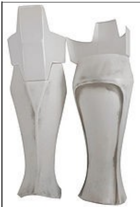
Lower Leg Armor For 501st approval: