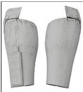
Forearm Armor For 501st approval: