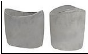
Upper Arm Armor For 501st approval: