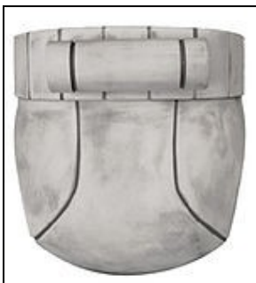
Posterior Armor, belt rear and Detonator For 501st approval: