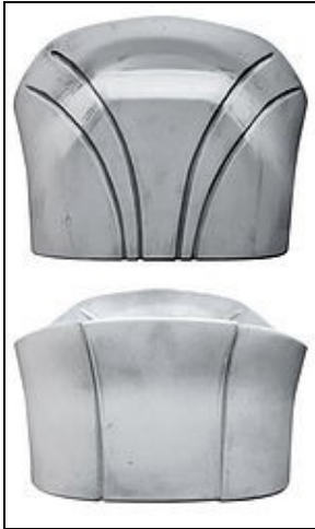
Abdomen Armor For 501st approval: