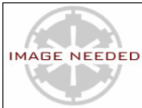
Helmet For 501st approval:

The following costume components are present and appear as described below.