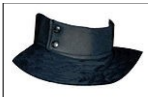
Neck Seal For 501st approval: