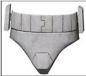
Codpiece and Belt front For 501st approval: