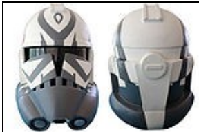
Helmet For 501st approval:

The following costume components are present and appear as described below.