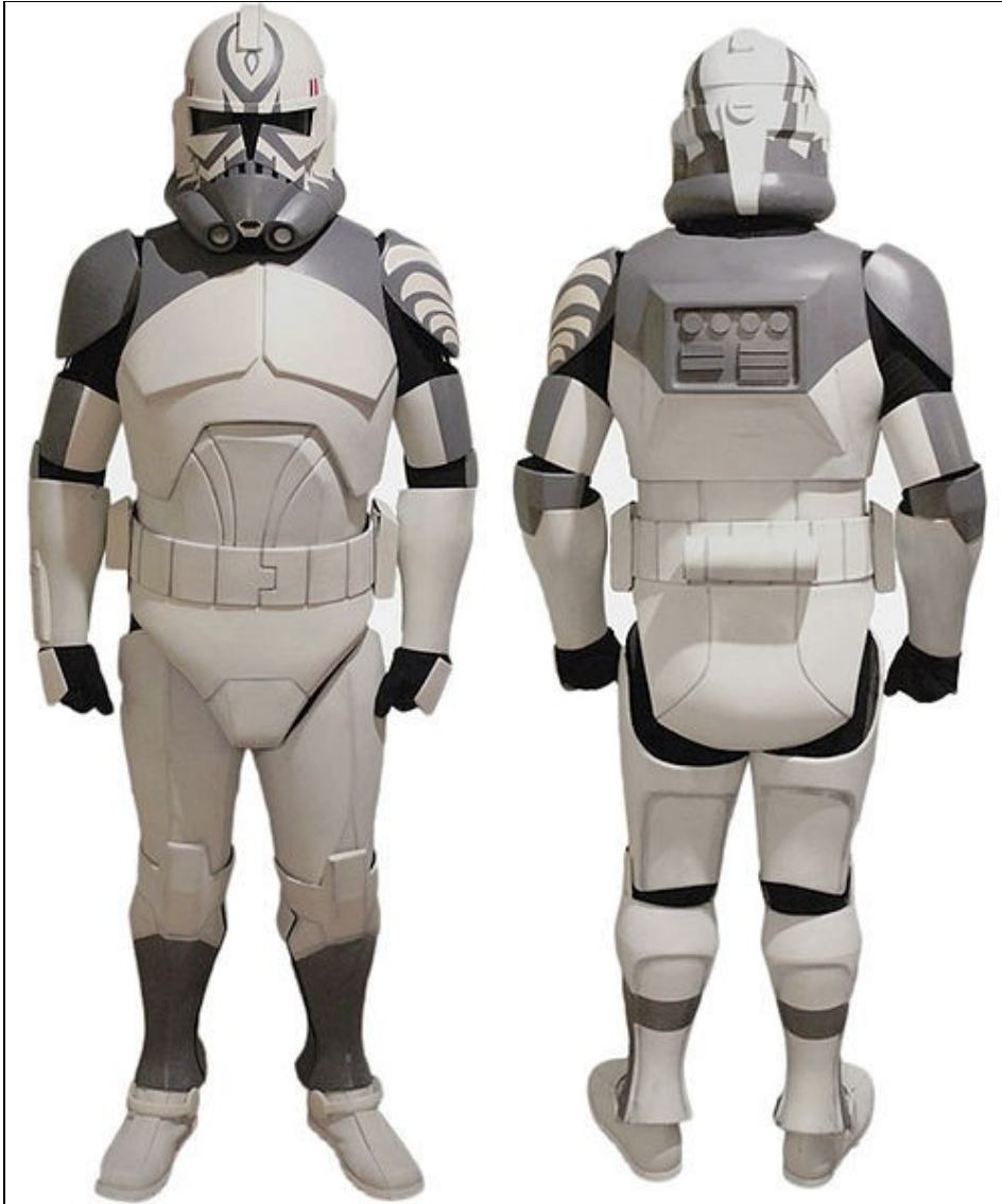
Model TC 8547