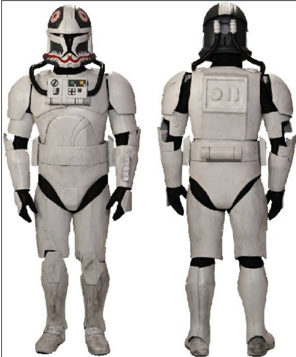
Model CP 9327