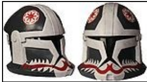
Helmet For 501st approval:

The following costume components are present and appear as described below.