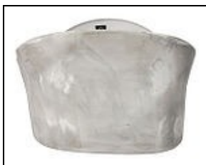
Kidney Armor For 501st approval: