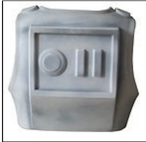
Back Armor For 501st approval: