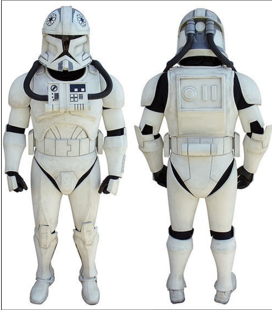
Model CP 6366 , Photo by Phil E.