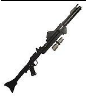
DC-15A Blaster Rifle For 501st approval:

Manufactured by BlasTech Industries, the DC-15A is a tibanna gas, cartridge powered weapon. Hyper-ionized blue plasma bolts are more than capable of penetrating armored units. Exceptionally effective against both droids and contemporary targets.