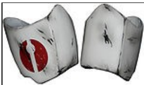
Upper Arm Armor For 501st approval: