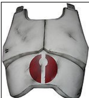
Chest Armor For 501st approval: