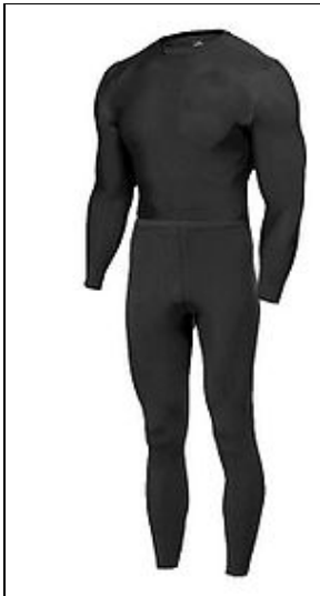
Under Suit For 501st approval: