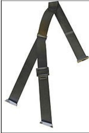
Command Harness For 501st approval: