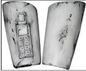
Forearm Armor For 501st approval: