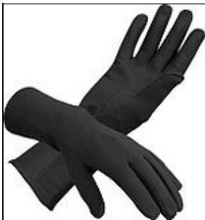
Gloves For 501st approval: