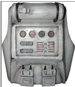
Back Armor For 501st approval: