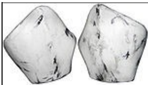
Hand Plates For 501st approval: