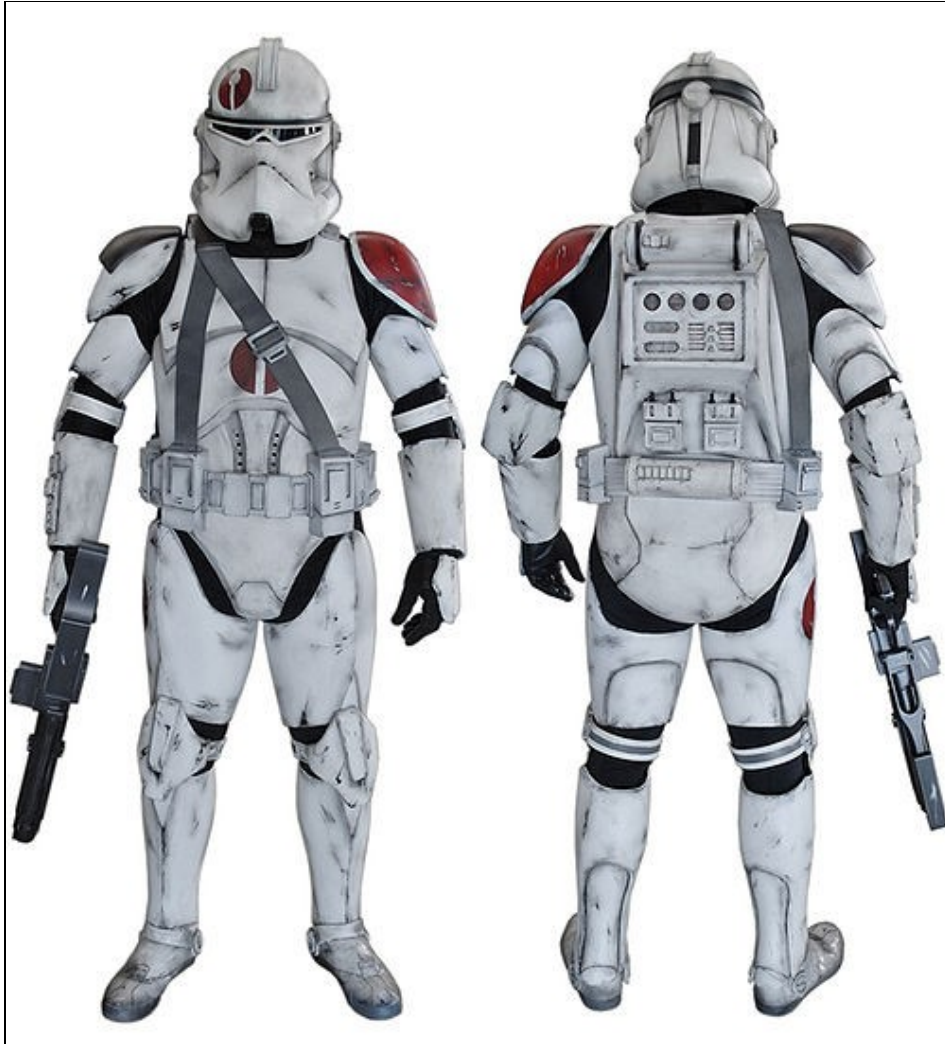
Model CC 6838