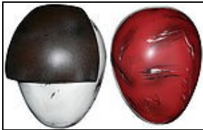
Shoulder Armor For 501st approval: