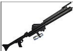
DC-15A Blaster Rifle (animated style) For 501st approval:

Manufactured by BlasTech Industries, this blaster is the standard issue weapon carried by the Clone Troopers of the Grand Army of the Republic.