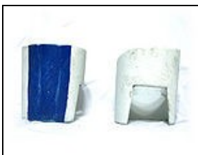
Upper Arm Armor For 501st approval: