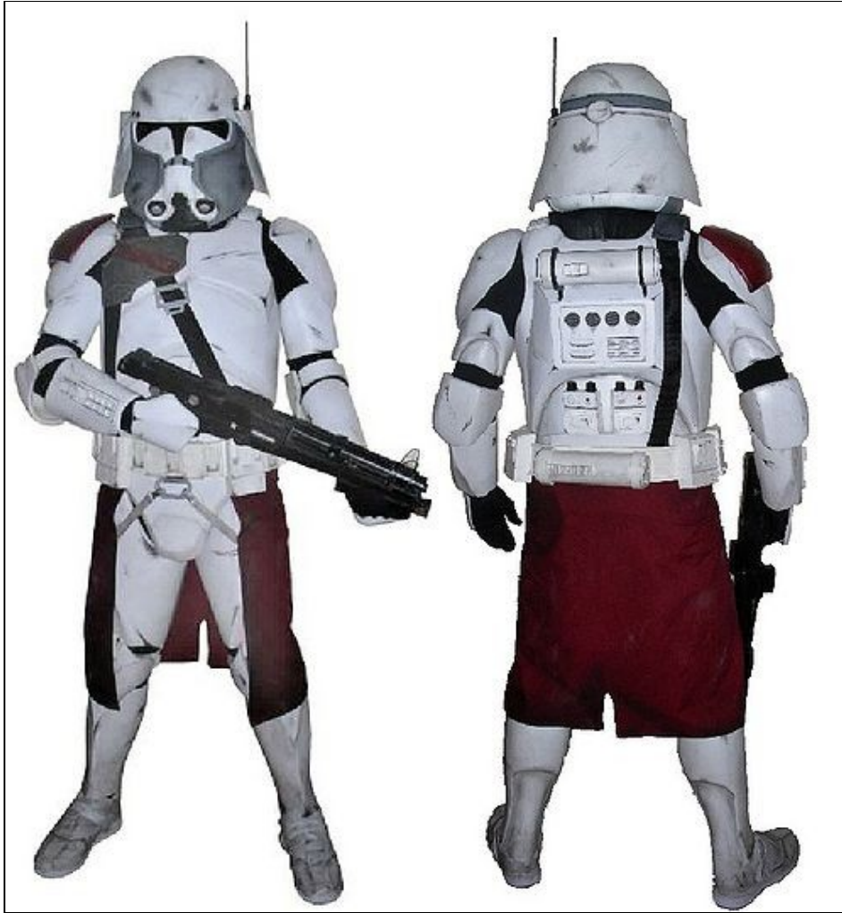
Model CC4841