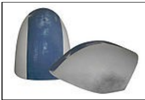
Shoulder Armor For 501st approval: