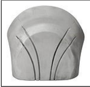
Abdomen Armor For 501st approval: