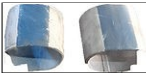
Upper Arm Armor For 501st approval: