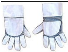
Gloves For 501st approval: