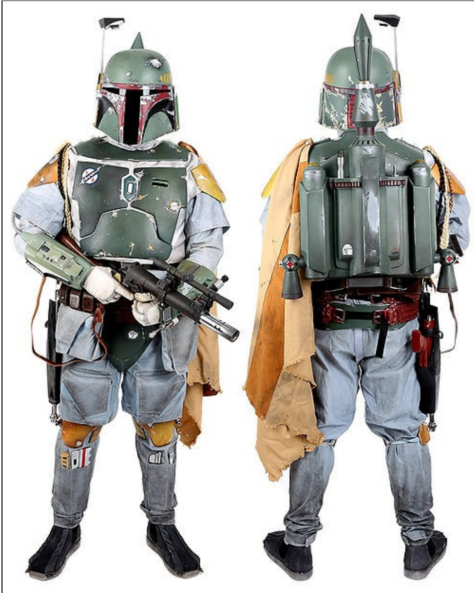
Model BH 6908 Lou Platania