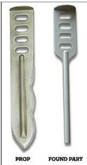
Shin Tool: Survival Knife For 501st approval: