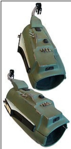
Right Gauntlet For 501st approval: