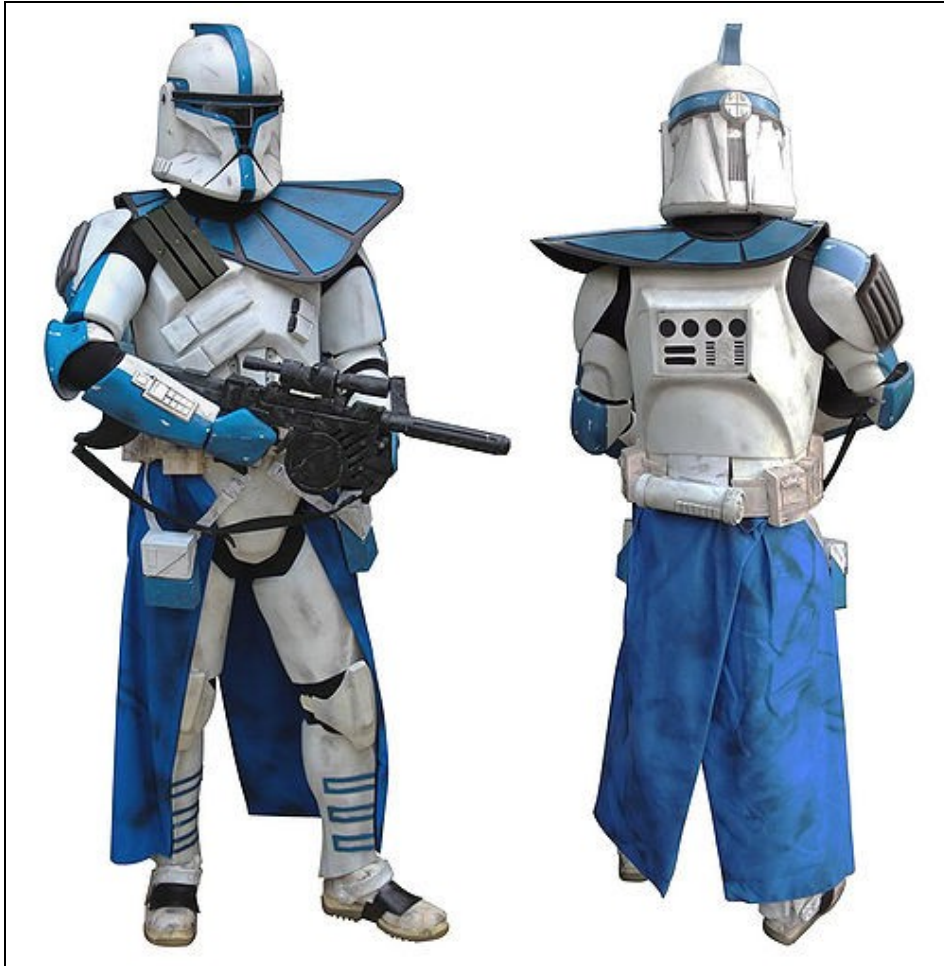
Model AR 6065