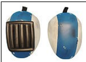
Shoulder Armor For 501st approval: