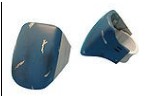
Elbow Armor For 501st approval: