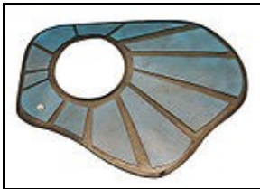
Command Pauldron For 501st approval: