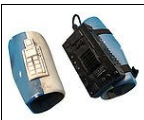
Forearm Armor For 501st approval: