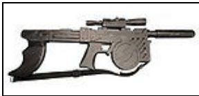
Westar-M5 Blaster Rifle For 501st approval:

Items below are optional costume accessories. These items are not required for approval, but if present appear as described below.